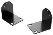
DW-G419RE 19" rack mount ears